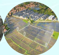
Land- Records Surveying